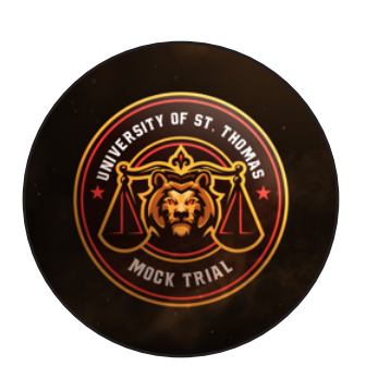
ST. THOMAS UNIVERSITY A