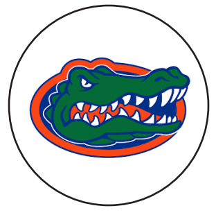
UNIVERSITY OF FLORIDA A & B